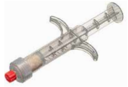
5 cc ORDER: TC-FFS-05