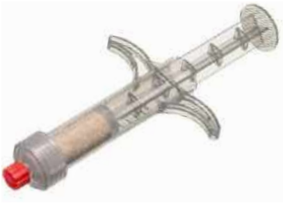
10 cc ORDER: TC-FFS-10

Moldable Demineralized Bone Fiber with Mineralized Cortical Chips in Syringe for Easy Hydration, Mixing and Handling.