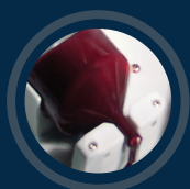
INPUT BMA OR BLOOD