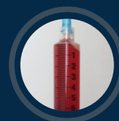
CELLS, PLATELETS & GROWTH FACTORS READY FOR USE